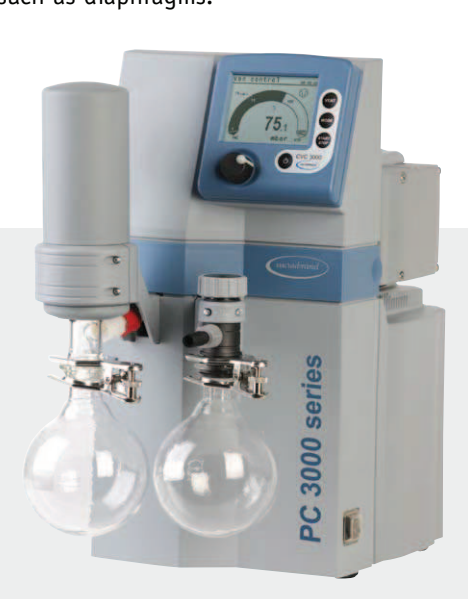
PC 3002 VARIO 2.8 m³/h 7 mbar